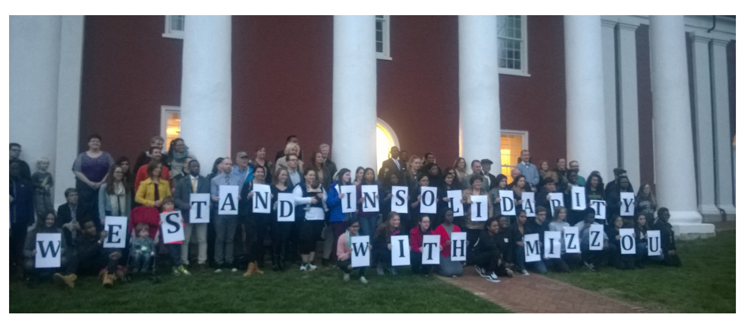
The protest at the University of Missouri over that university's handing of issues raised by students of color echoed across other campuses. At Washington & Lee University, in Lexington, Va., students and staff gathered on Nov. 18 at the antebellum-era Colonnade in a show of solidarity with the Mizzou protestors.

Research is a process of discovery—that is, intellectual discovery and personal discovery. You learn a lot about your own relationship with the past and views of the past—and that relationship evolves. And it will evolve for your entire career, not just until you get to your dissertation defense or when you get tenure. So keep an open mind to surprises.